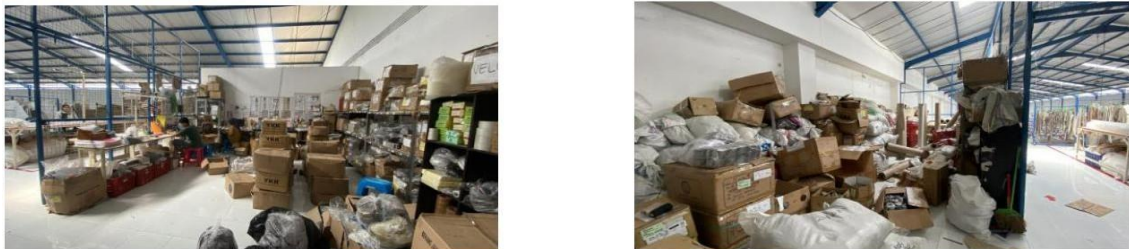
Figure 3.1 Accessories Warehouse

Currently, items placed in the accessories warehouse are placed randomly, occupying the available empty space. Plus there was a buildup of items on the floor. So the distance to pick up goods of any type in the current conditions is disrupted. After the goods have gone through the inspection process, they are arranged on the shelves. Arrangements can be made up to the maximum shelf capacity. It is hoped that the number of items available is in accordance with the maximum shelf capacity. This aims to prevent accumulation on the accessories warehouse floor. The layout can be seen in Figure 3.2.